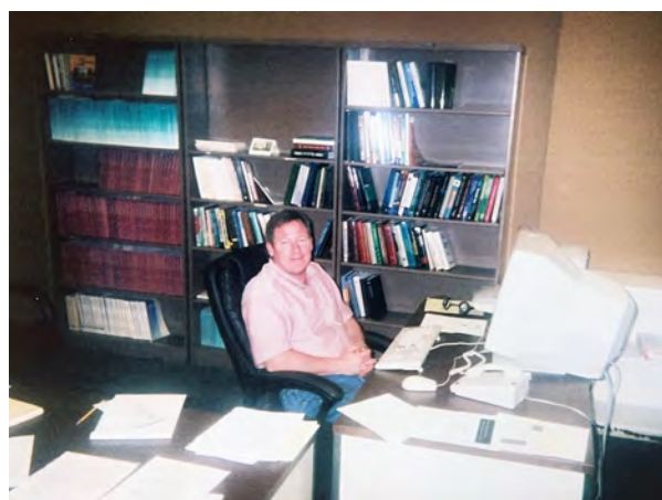
At work in his office in 2007