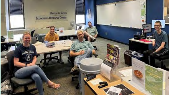
Last day (and pizza recruiting event), April 2024