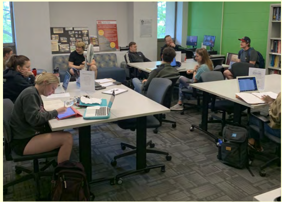
A busy day at the NEW Sharon G. Levin ERC !