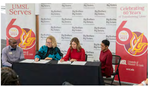
UMSL formalizes partnership with Big Brothers Big Sisters of Eastern Missouri to support future students with scholarships

They will work directly with NASA mentors to complete their project which will be launched on a future NASA rocket powered lander test flight on a test field designed to simulate the moon's surface. Their project centers around detecting vibrations of a rocket as it rises in altitude and the temperature changes that occur as a result. They hope to build a sensor that will give astronauts advanced notice of these changes which will allow them to deploy early safety measures. <u>Read more</u>.