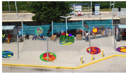
TRANSIT PLAZA PROPOSAL Featuring - Enhanced Seating, Shade Structures, Sidewalk Art, Fence Art, & Freestanding Interactive Art