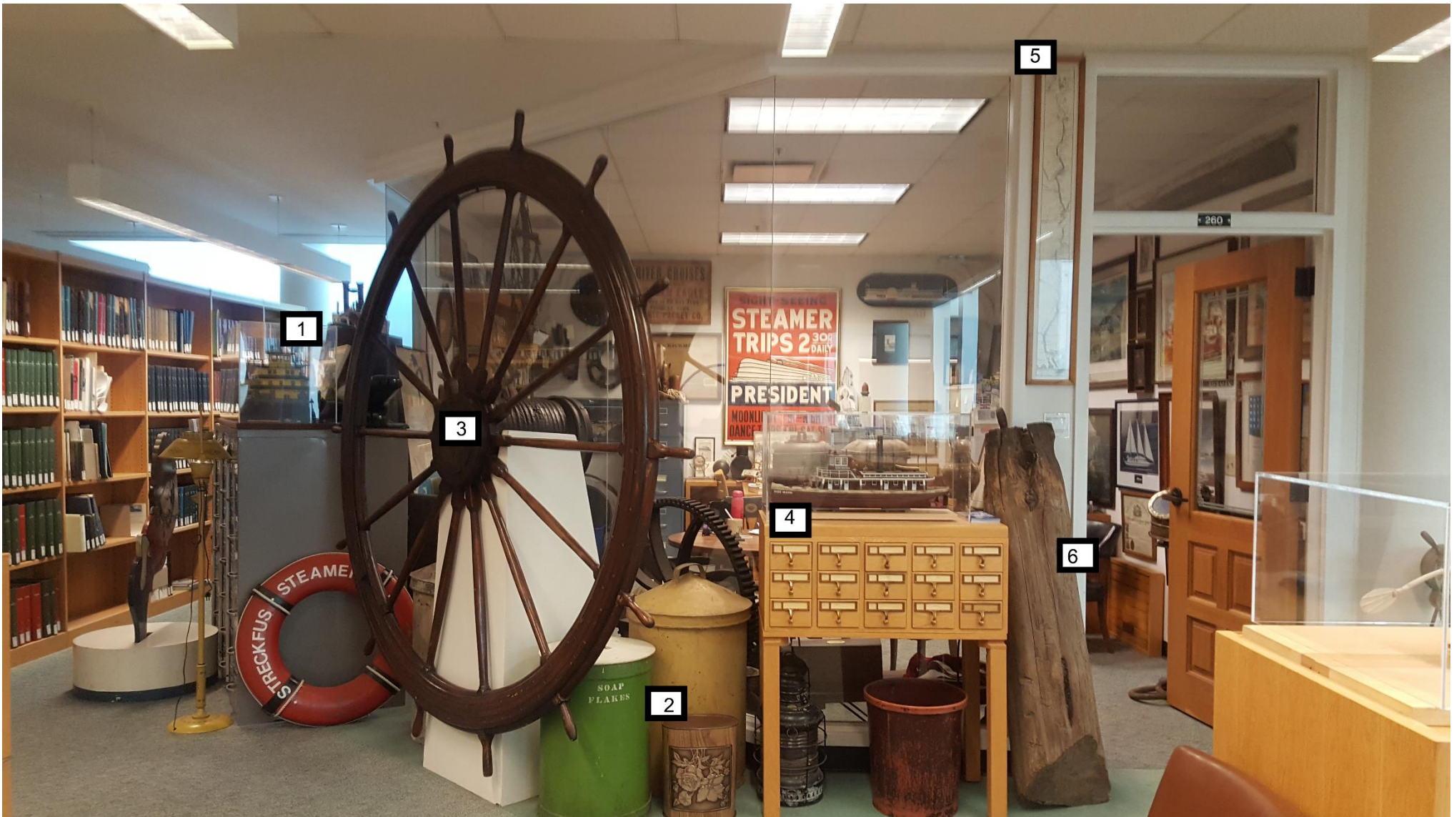
FRONT WALL (outside the glass)