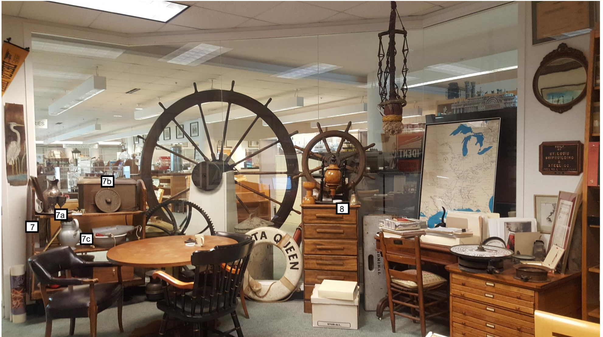
FRONT WALL (inside the glass)