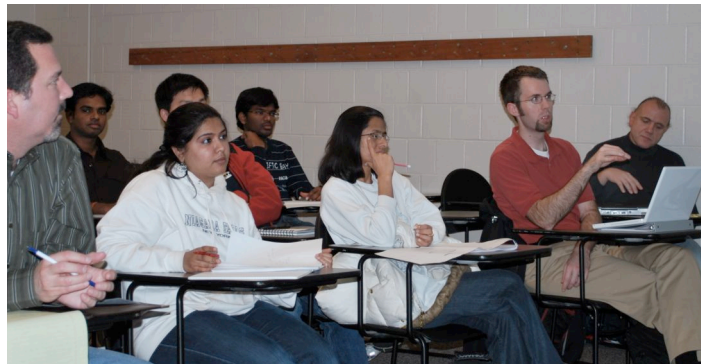
Students in CS 5500 discuss their projects during class

The first project ran in CS 5500 (Software Engineering) in Fall 2007. ESI provided financial support in the form of a grant. If a set of core requirements was met, ESI would also pay licensing