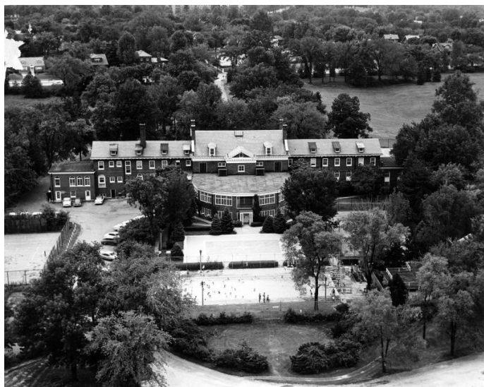
The old administration (Bellerive Country Club) building.