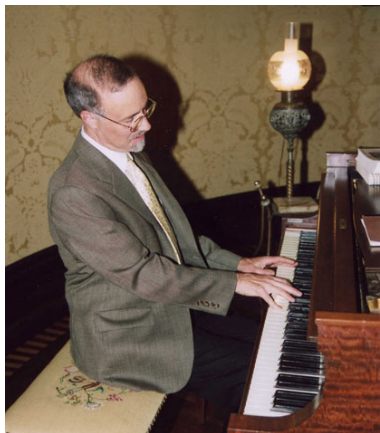
Chancellor entertaining guests at the Governor's Mansion.