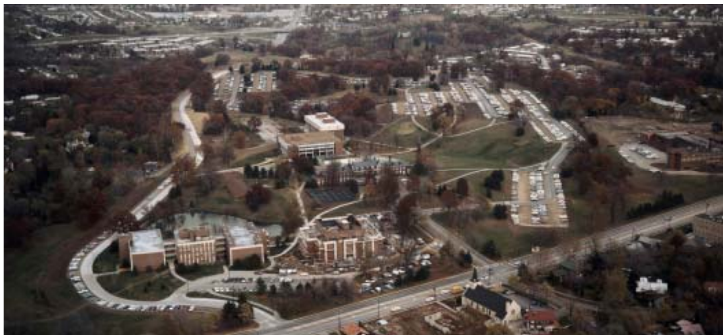
An aerial shot of the campus circa 1970 showing Benton, Stadler and Clark Halls and the Thomas Jefferson Library.