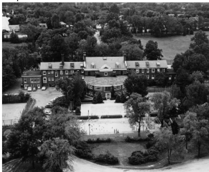
Belle rive Country Club clubhouse, known as the Administration Building, served as administrative, classroom, and library space until Benton Hall was completed in 1966. The Administration Building was torn down in 1978. The area is now known as Founder's Circle and includes the green space in front of the Thomas Jefferson Library.

As the 1970s came to an end, the department had grown in stature but needed more facilities and equipment. We were still using the Varian T-60 NMR spectrometers, one obtained with University funds and the others obtained as surplus equipment from Monsanto. We had a committee that wrote NSF equipment grants and in 1978 we were successful, in part, in that the agency had been encouraging institutions in large cities to collaborate.