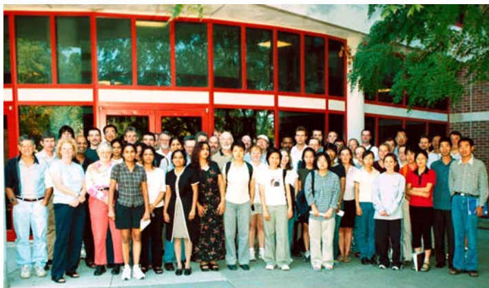
Faculty and students following a department seminar, Fall 2002

"One can help the institution by contributing money, providing assistance both professional and in other ways. But particularly at this moment you can also help the institution as citizens, taxpayers and voters. Your investment – the value of your degree – is at stake. Missouri does not support its institutions of higher education very well. Missouri is not a poor state and indeed has enormous potential to raise more funds to provide for its citizens in the areas of education, social services, transportation, etc. I looked up some data from the 2000 Statistical Abstract of the US, published by the Census Bureau. Among the states, Missouri is: 15 th in population; 17 th in Gross State Product; 23 rd in average annual income; 32 nd in persons with a bachelor's degree; 35 th in