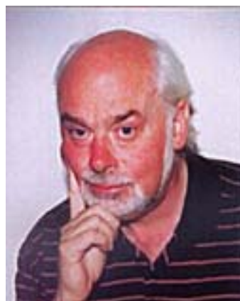
J. Fraser Stoddart, 2002 Robert W. Murray Lecturer.