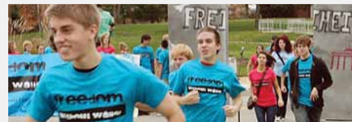
Freedom without walls celebration