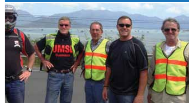
On the Road in Nha Trang Vietnam