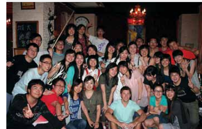
Class at City University of Hong Kong