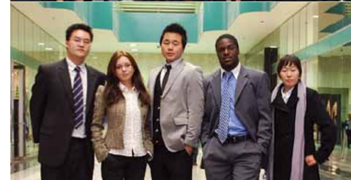
IBC and AIESEC International Clubs in Cooperation