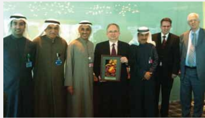
10th Anniversary of our association with GUST

UM-St. Louis Center for International Studies coordinates the international initiatives and programs of the university. Toward that end, the Center supports faculty research, administers academic programs, recruits and provides services to international students, negotiates and administers exchange and study abroad programs, works with local and state agencies and organizations to promote international business development efforts, presents cultural and informational programs for the campus and the community, and conducts many other internationally-related programs.