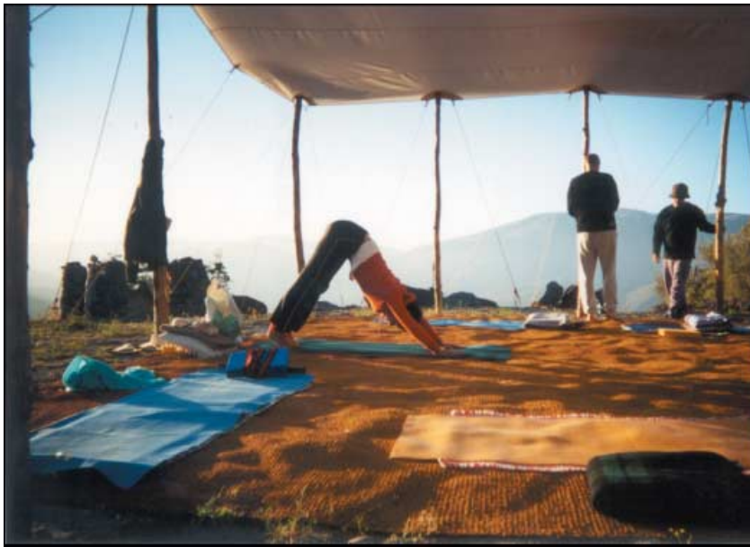
Figure 2 The uneven floor of the yoga platform