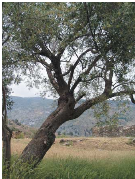
Figure 3 The olive tree