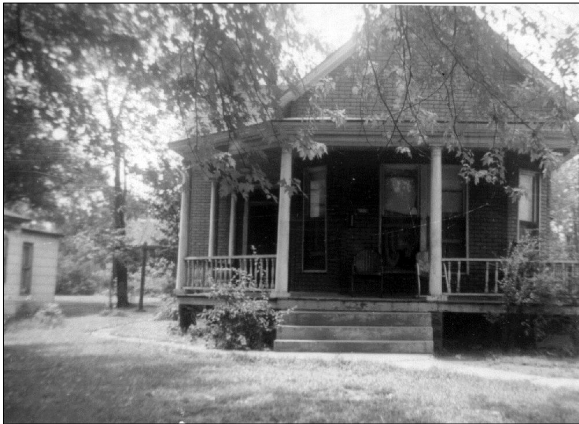
The Badgett home in Mount Vernon, Illinois