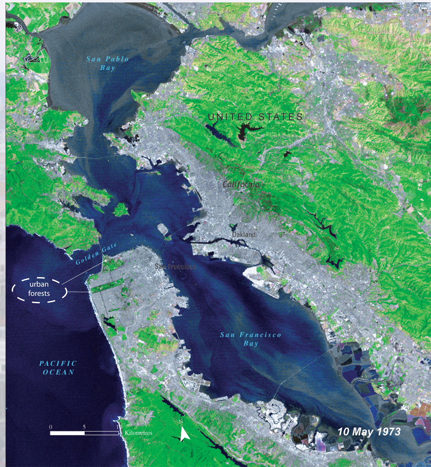
10 MAY 1973 Landsat MSS False Colour Composite RGB, (2,4,1)