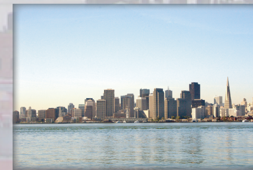
Skyline of the city