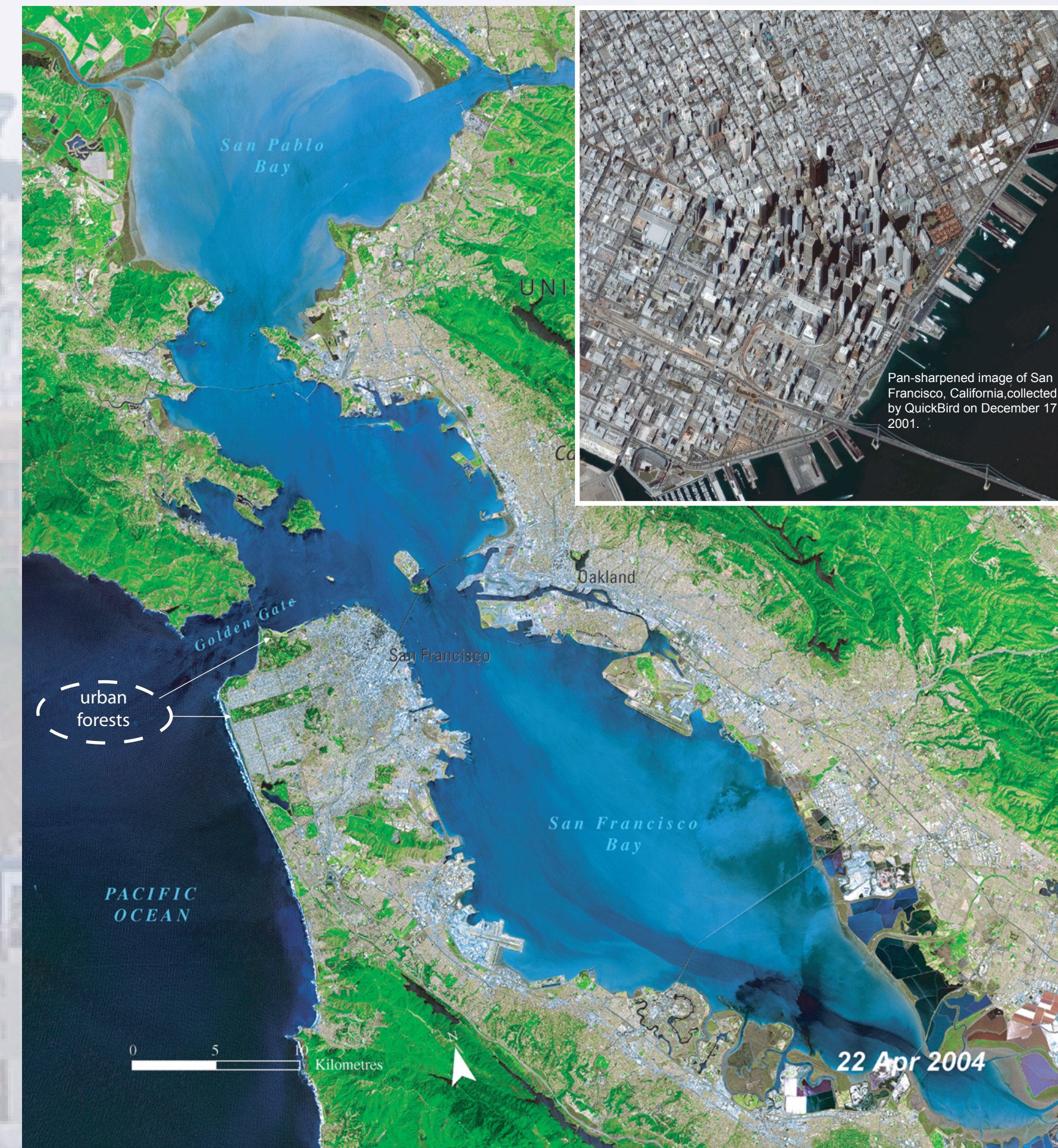
22 APRIL 2004 ASTER False Colour Composite RGB, bands (2,3,1)

San Francisco has been selected host city for World Environment Day 2005, the first time ever in North America. 2005 is also the 60th anniversary of the United Nations, which was founded at the 1945 charter convention in San Francisco. Its selection fits the theme for World Environment Day 2005: "Green Cities: Where the Future Lives," given the city's effort to promote a well-planned, clean, healthy and safe environment.