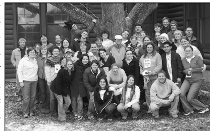
Awakening 2006 Retreatants show they are made to shine!

renewed outlook on faith, service and a realization that we are all "made to shine."