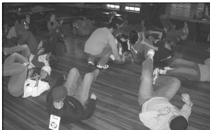
The retreatants get down on the ground for an icebreaker on Saturday morning!