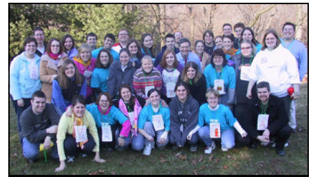
A rockin' good time was had by all at the 2005 Awakenings Retreat!

We really appreciate your support of the Catholic Newman Center. Here is a breakdown of how your future gift assists us in our ministry. Thank you for your continued support!