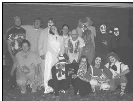
The Ghouls and the Goblins of the Newman Center come out in full force for the Annual Haunted Garage!