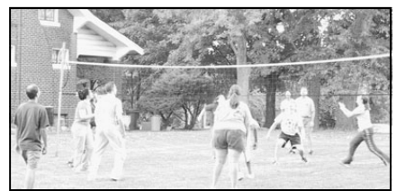
Several highly competitive volleyball games were played at the Ice Cream and Volleyball Social held in September.