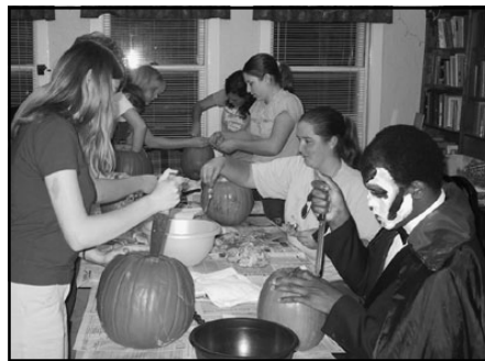
Students participate in the 4th Annual Pumpkin Carving Contest.