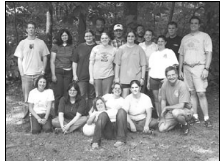
Great Getaway participants gather for a group photo to prove they were there.