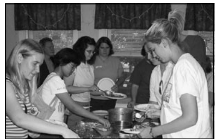
Students partake in a yummy meal at the Newman Center to kick off the Fall semester!