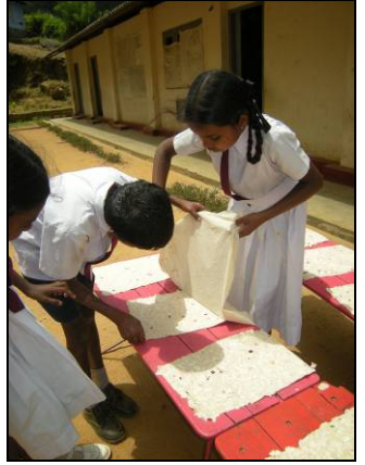
Step 4: Hanging & Drying