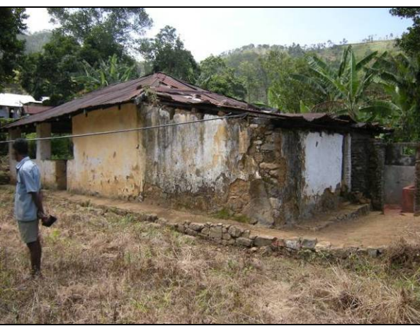
"BEFORE" – July 2008