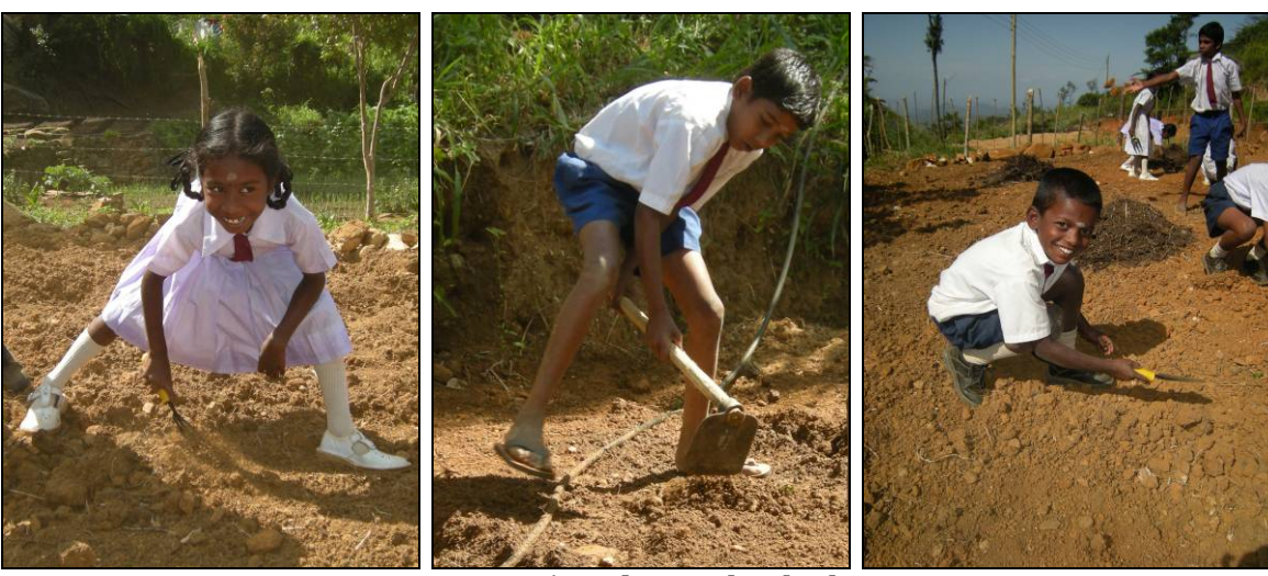
Preparing the garden beds

Beginning in January 2009, we will also build a compost pit at the school; students will be provided an educational program on how to compost, and the benefits of composting as fertilizer for their school. They will also be provided with means to collect kitchen waste from home to contribute at the school.