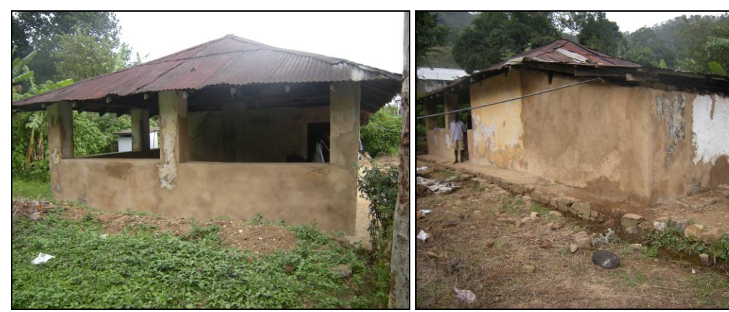
"IN PROGRESS" – August 2008

We have hired a contractor and workers from the estate to complete the job, which provides additional benefits the local community.