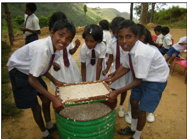
Step 1: Lifting