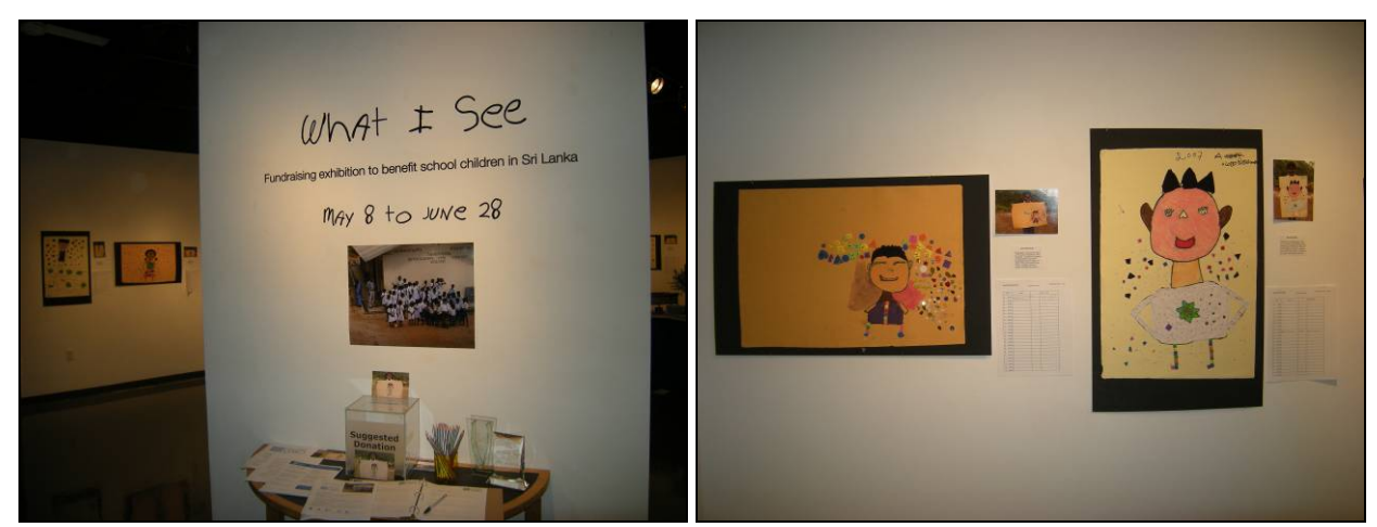
Gallery Visio Exhibition

From May 8<sup>th</sup> to June 28<sup>th</sup>, we held the What I See fundraising exhibition and silent auction at UMSL's Gallery Visio. On display were Macaldeniya children's self portraits from an art workshop held in January 2008.