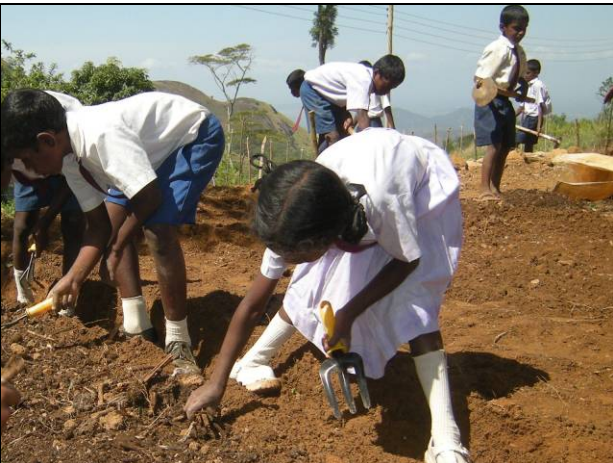
Mixing organic fertilizer with the soil