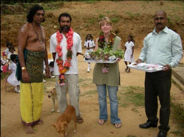
Puny & I are presented with garlands