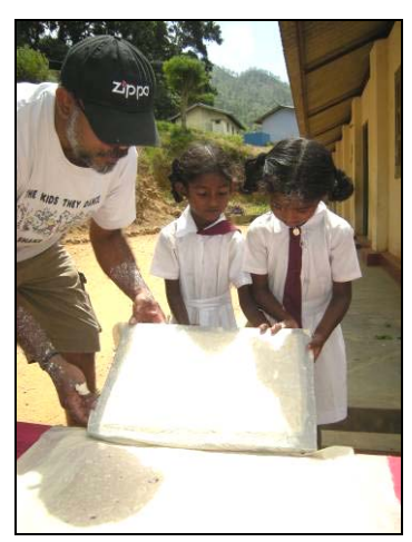
Step 2: Couching