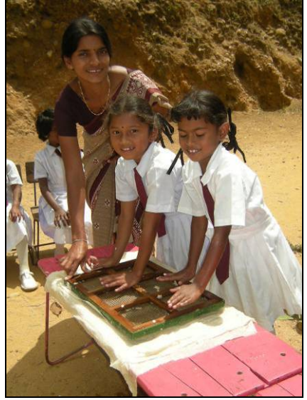
Step 3: Pressing