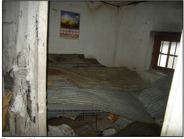
School Library Site