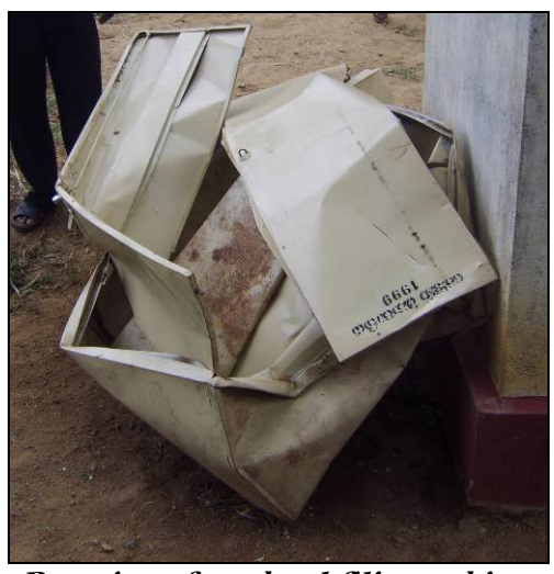
Remains of a school filing cabinet